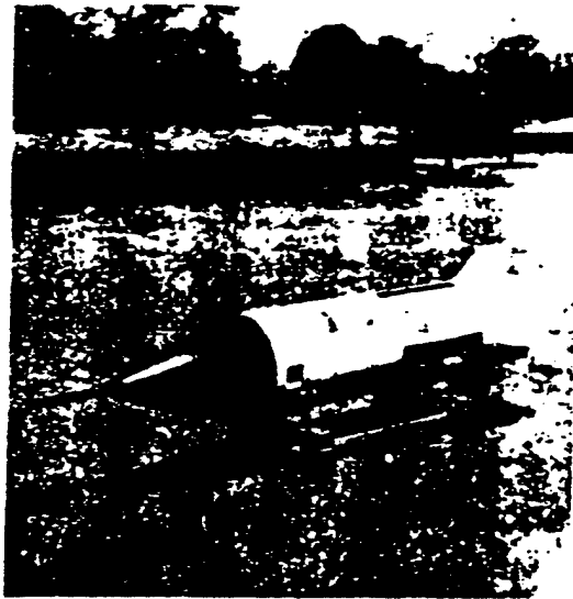
Fig.2 Metrological Microgravity Experimental Capsule (Illegible)

Beginning in 1960, China has launched sounding rockets for a total of 260 rockets of 18 types. Among these, 6 types are specialized high altitude metrological and space physics services. In 1988, a low latitude comprehensive launch base was set up on Hainan Island in order to expand the scope of research associated with space physics.